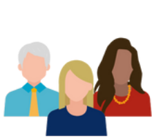
EXECUTIVES & ORGANIZATIONAL LEADERS

The Leadership Development Institute offers open-enrollment and custom programs for leaders at all levels. Our programs include several distinguishing factors, such as a focus on individual development, experiential activities, superior instruction, action-oriented development plans and an interactive learning process featuring personal assessment and one-on-one coaching.