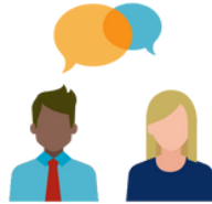
EMERGING LEADERS & INDIVIDUAL CONTRIBUTORS